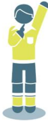
Indirect free kick