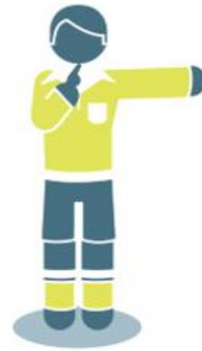
Direct free kick