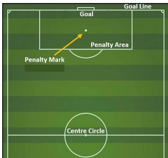
Figure 2. Diagram of Penalty Area

The penalty mark is only needed for U11-U13 age groups and is 9 m from the goal line. Cones must not be used to indicate the penalty mark.